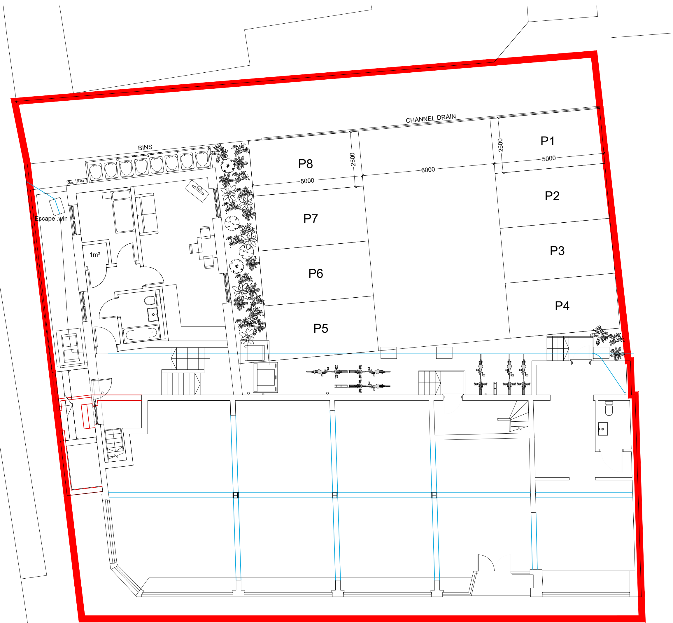
Proposed Ground Floor Plan 1:100 0 1 2 3 4 5

Existing cycle parking 3 x Sheffield stands